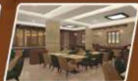
Veggie Delight Restaurant