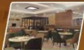
Tamboo - Family Restaurant and Bar