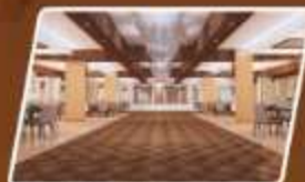
Diamond Banquet Hall