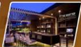
Rooftop Bar and Lounge